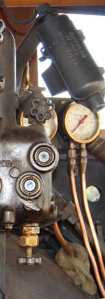
licator. s Tanner Photo

from the boiler. You Think “150psi can’t push water into a boiler that has 150psi. If the pressure differential is zero, nothing will happen.” The secret is something called the latent heat of vaporization. When water is heated to boiling, additional heat must be added for that water to become steam at the same temperature. When steam from the boiler mixes with cool water from the tender the steam condenses, and the heat added to convert boiler water to steam is recovered. Heat imparts kinetic energy to the feed water, in the form of velocity. This energy opens a check valve on the boiler, and in flows the feedwater. Simple, right?