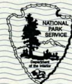
Chief, National Historic Landmarks Program National Park Service