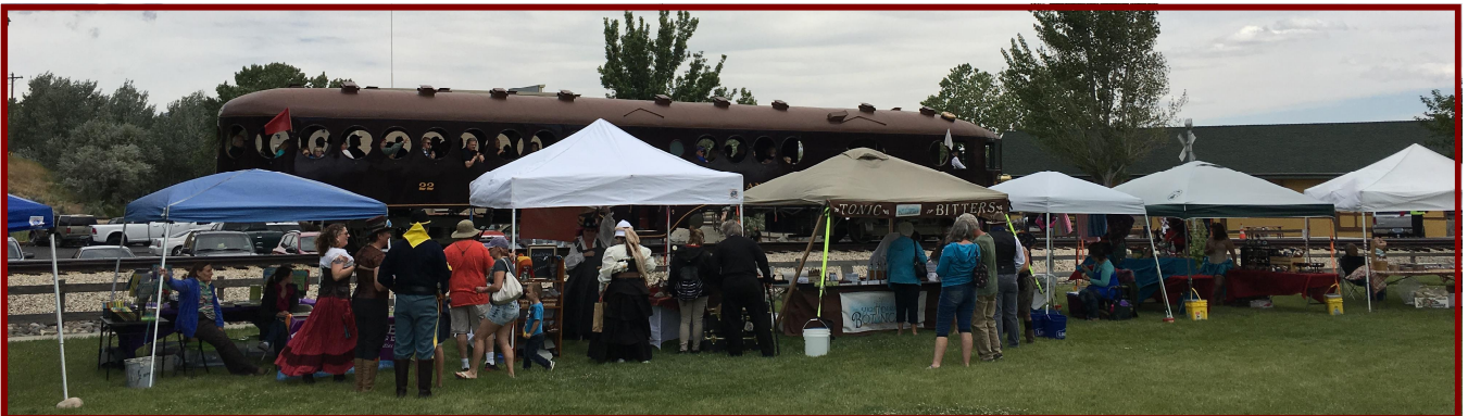
The McKeen Motor Car cruises past Gibson Park, full of vendors and guests enjoying the Steampunk 'N' Trains festivities

seum. Best of all, visitors were able to take a train ride on their choice of the steam train pulled by the V & T locomotive #25, the McKeen motor car, or both. We would like to thank our special guests, members of High Desert Steam, for attending in full steampunk attire. The event helped raise money for the Friends to support future events and projects at the museum. Next year the Steampunk 'N' Trains event is proposed to last two days with the possibility of a private Steampunk event in the evening. Thank you all for attending and making this 1 st Annual Steampunk 'N' Trains event a memorable one. 🚂