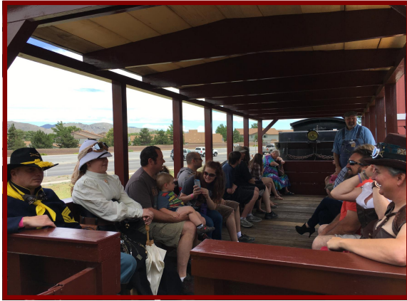
Visitors enjoy a ride in the recently overhauled V&T tunnel car #53 at the Steampunk 'N' Trains Event

On June 18, Old Victorian met Science Fiction as Steampunk descended upon the museum when the Friends of the Nevada State Railroad Museum, in partnership with the Nevada State Railroad Museum, hosted the 1 st Annual Steampunk 'N' Trains event. The