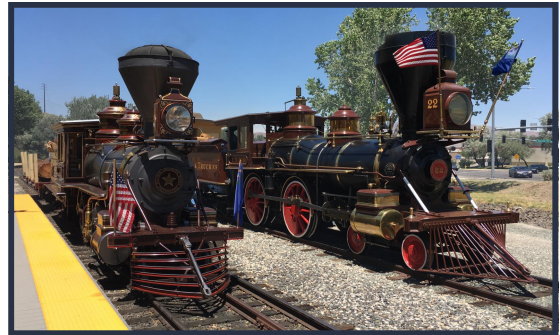
The Two Beauties - Glenbrook & Inyo Steamed Up

For the third year in a row the museum offered an all-inclusive wristband for sale. For $15 each day, adults received admission to the museum and unlimited train rides aboard No. 25 and the McKeen Car. On