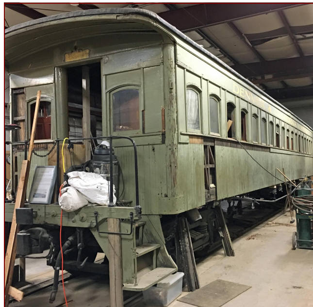
Coach 17 undergoing stabilization work in the NSRM Shop.

"Let me think about this. Do you know if there was one engine that always pushed the flanger?"