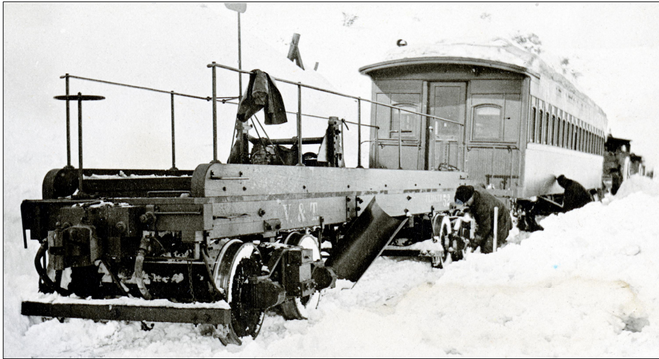
The V&T flanger goes off the rails with Coach 17 during a snowstorm in Carson City, January 1916. V&T No. 25, Coach 17, and the flanger had a unique air system tying them together for plow train service.

and the flanger would provide train brakes to the locomotive to slow and stop as the locomotive would have no brakes when in consist with the flanger.”